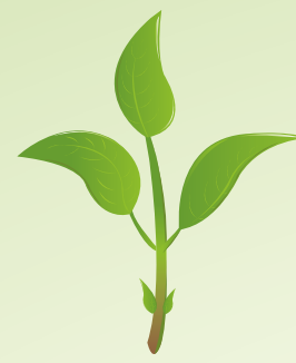
Seedling / Cutting